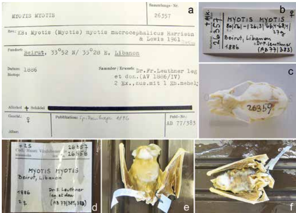
Fig. 6. A selection of items and evidence of the entry 1886/IV. a, b, d, f – Myotis myotis (NMW 26357, 26358); c, e – Rhinolophus mehelyi (NMW 26359). a – card of the modern card index (NMW 26357); b – skull label (NMW 26357); c – complete skull, dorsal aspect; d – label of the alcohol specimens; e – alcohol specimen; f – alcohol specimen (NMW 26358).

Obr. 6. Výběr sbírkových položek a dokumentace přírůstkového čísla 1886/IV. a, b, d, f – Myotis myotis (NMW 26357, 26358); c, e – Rhinolophus mehelyi (NMW 26359). a – lístek současného lístkového katalogu (NMW 26357); b – sbírkový lístek lebky (NMW 26357); c – úplná lebka, hřbetní pohled; d – sbírkový lístek lihových jedinců; e – lihový jedinec; f – lihový jedinec (NMW 26358).